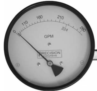
Example GPM meter for VFL400 0-260 GPM based on 75" WC with the 224.0 click marked.

Model 300.3 Test Kit is a differential pressure meter designed for permanent installation and consists of a 4 1/2" diaphragm type meter ( \pm 2\% F.S.). Available to read directly in GPM by special order only. Uses customer supplied piping, valves, etc. for field attachment to the flow element.